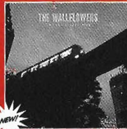
THE WALLFLOWERS COLLECTED: 1998-2008