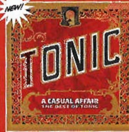
TONIC A CASUAL AFFAIR THE BEST OF TONIC