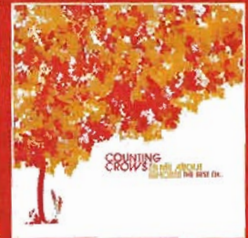
COUNTING CROWS FAME ABOUT GHOSTS THE BEST OF...

CATCH ALL OF THESE ARTISTS ON THE ROAD THIS SUMMER ▶ CATCH ALL OF THESE ARTISTS ON THE ROAD THIS SUMMER ▶ CATCH ALL OF THESE ARTISTS ON THE ROAD THIS SUMMER